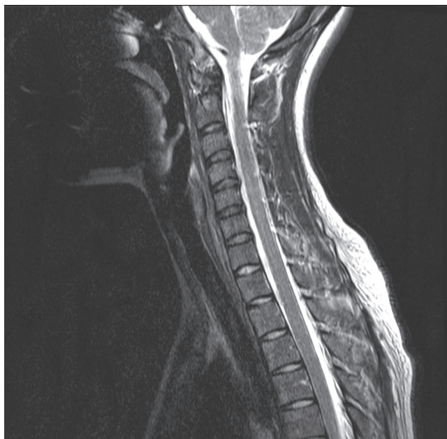
Fig. 1. Cervical magnetic resonance imaging of the patient. According to interpretation of a radiologic specialist, there was no evidence of dural injury except for mild disc bulging in C3–4, C4–5, and C5–6.

while sitting because of the postural headache. A cervical magnetic resonance imaging (MRI) was performed, which revealed no specific evidence of dural injury (Fig. 1).